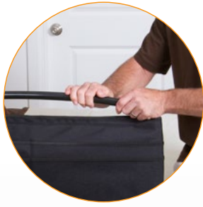
Getting Out of Bed is Easier With the Hand Rail