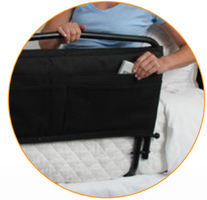
Includes Organizer Pouch