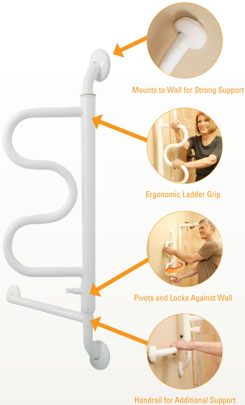
Mounts to Wall for Strong Support