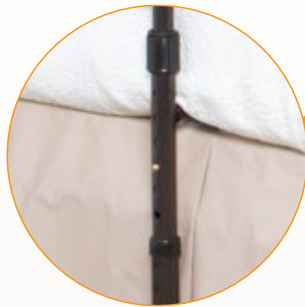
Adjustable Legs Provide Stability