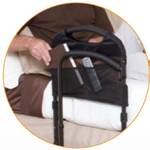
Includes Organizer Pouch