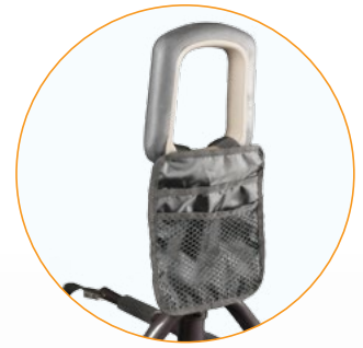
Includes Organizer Pouch