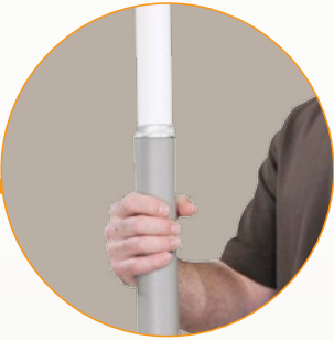
Adjusts to Fit 7'-10'