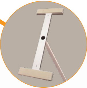
Tension Mounted—No Marks