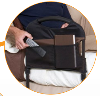
Includes Organizer Pouch