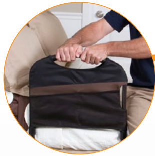
Accessible Handle Provides Support