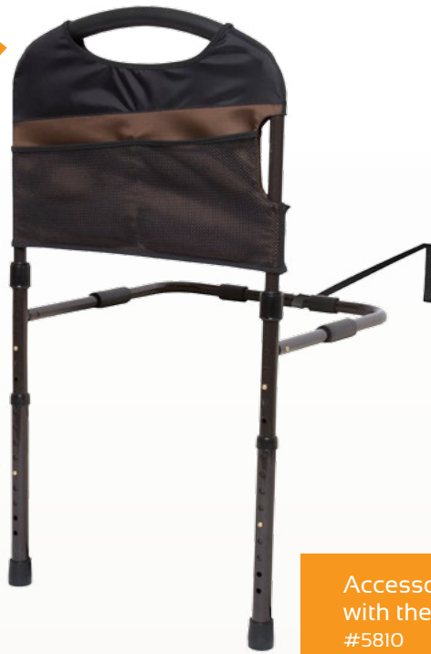
Accessorize the Stable Rail with the Stander Arm #5810