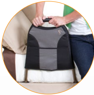
Ergonomic Handle Provides Support