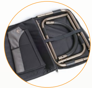
Easily Fits into Included Carrying Case