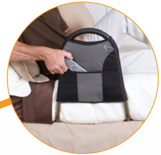
Includes Organizer Pouch